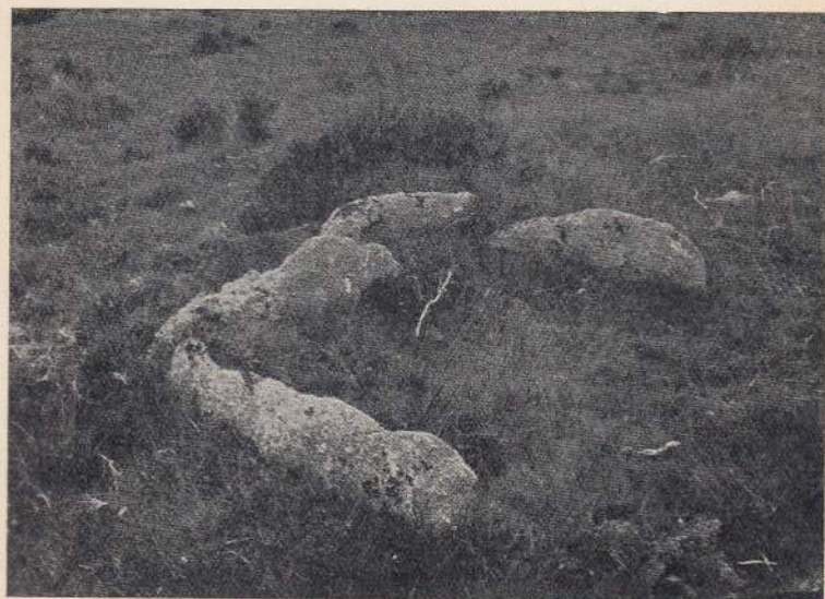
VIEW, looking N.86°E.