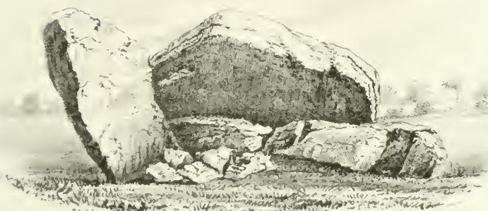
Drewhoughton Cromlech 21 st Feb y 1862 From Photograph