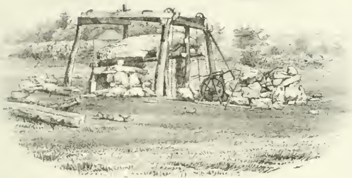
Raising the Quoit 6 th Oct r 1862