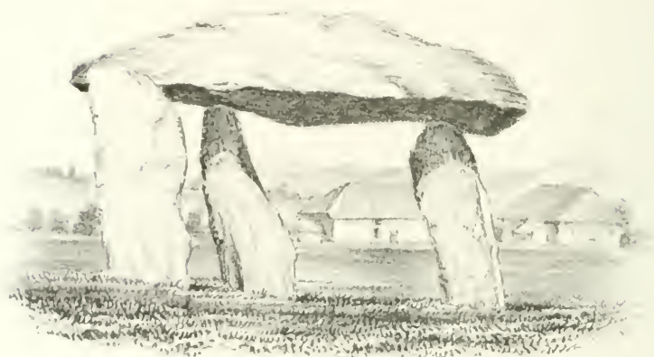
From North West