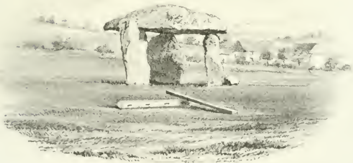
Cromlech destroyed 17 th Nov r 1862